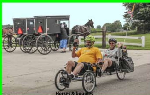
Horses & buggies