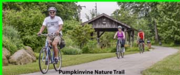
Pumpkinvine Nature Trail

Ride start: Goshen and Shipshewana, Ind.