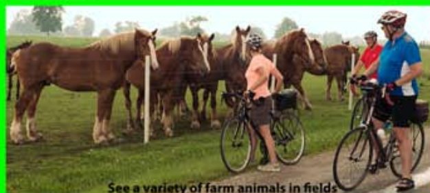
See a variety of farm animals in fields