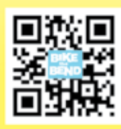
Visit for More Information

Sunday, June 14, 2015 6:30 am - 11:30 am